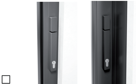
With profile cylinder (full cylinder), turning knob inside + outside, push handle inside + outside

Locking inside: System colour (Standard) Special colour: _____