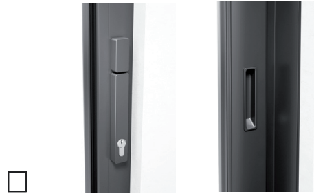
With profile cylinder (semi cylinder), turning knob inside, push handle inside, with shell handle outside