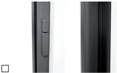
Without profile cylinder, turning knob inside, push handle inside, without shell handle outside