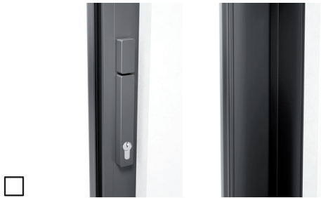
With profile cylinder (semi cylinder), turning knob inside, push handle inside, without shell handle outside